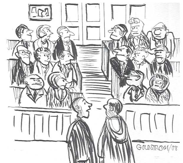
Do you sense that 2 years of presidential campaign has had a trickle-down effect?

just say you are sorry. just say you remember her if you do. just let me talk if I want to. let me cry when I must.